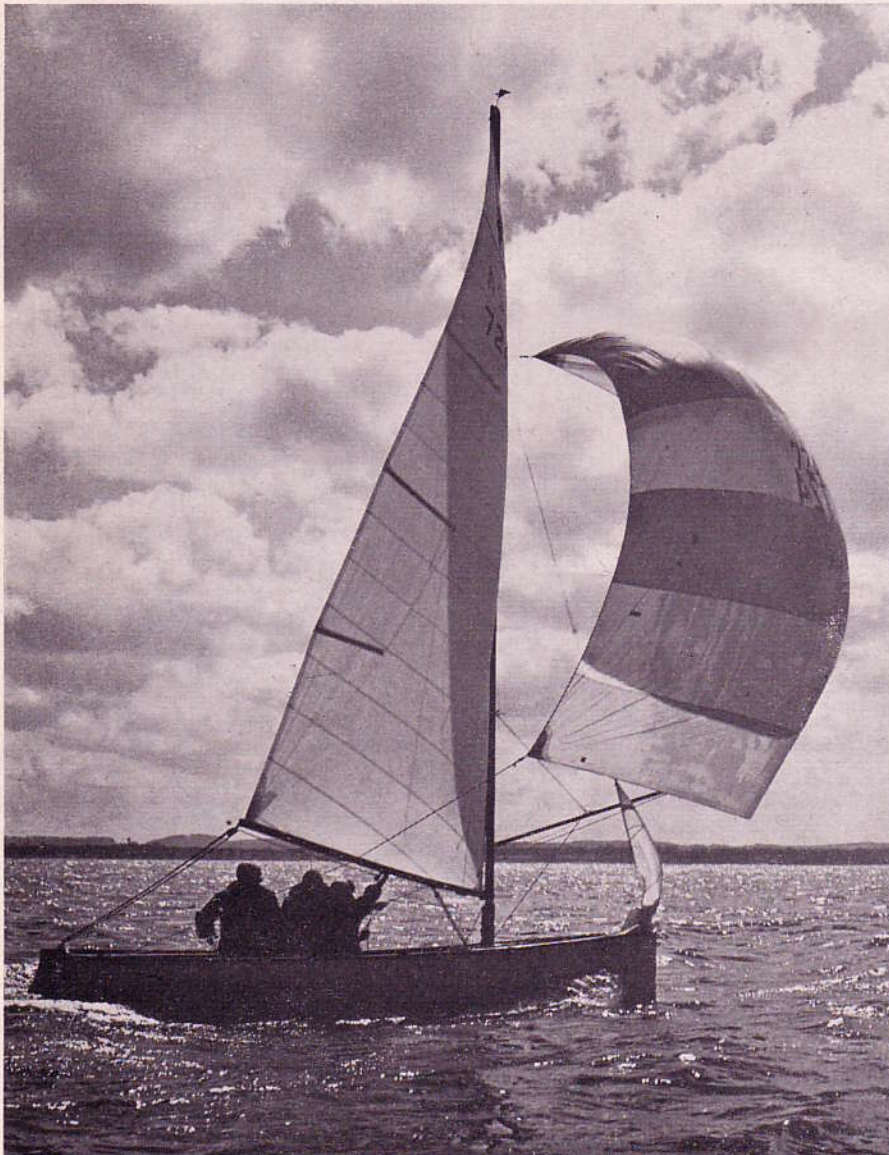
PRESIDENT AT WORK